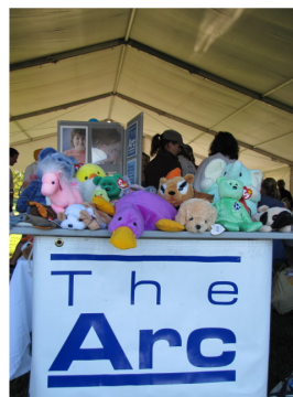
Beanie Babie Central