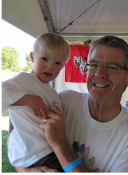
"Mile High Myles" and Grandpa