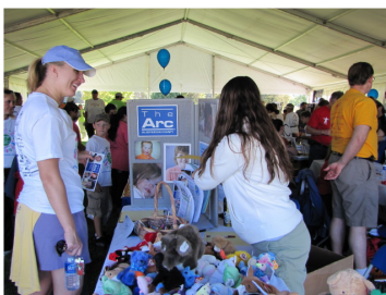
The Arc's Resource Fair Booth