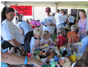
Kids clamoring for Beanie Babies