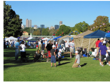
After the Walk