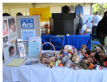
The Arc's Resource Fair Booth